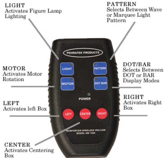
Figure Light Motor Activation Light Patterns Dot-Bar Display Mode

The Wireless XM-1000 offers a full featured hand-held remote control that gives the operator COMPLETE CONTROL OVER 7 functions including: